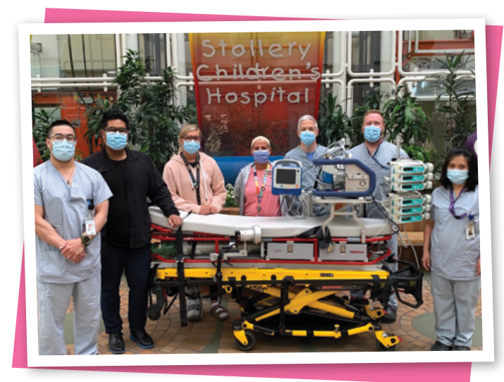
ECLS core team with new ECMO transport stretcher

The ECMO team is a skilled group of Registered Nurses, respiratory therapists and physicians who work alongside the Pediatric Intensive Care Unit (PICU) transport team. They have all received